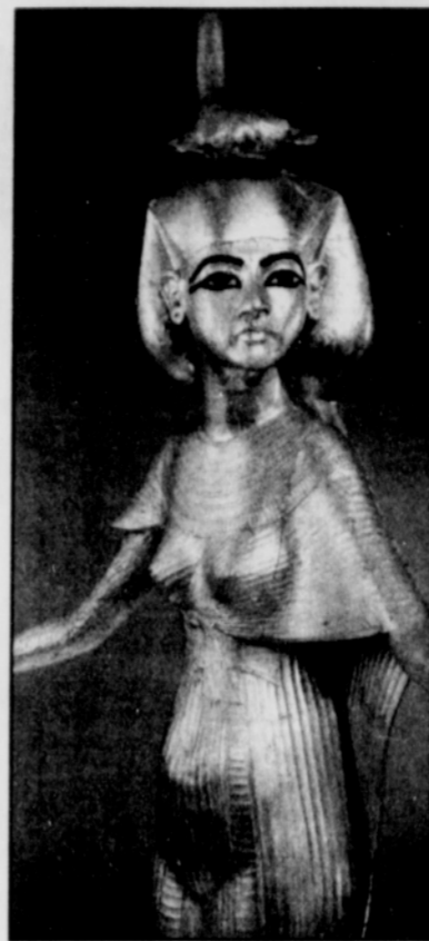
"Young lady in 'Empire style' dress."