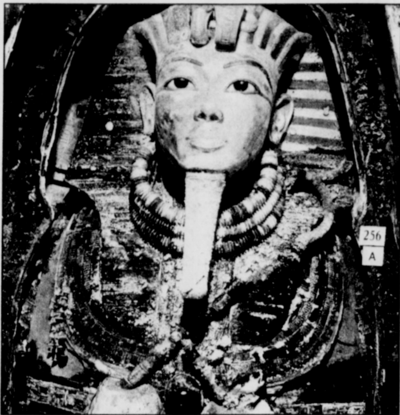
Egyptian King Tutan Khamun, no problem finding his look-alike at Jefferson High School

For instance, on page 109 of the distractingly beautiful publication described above, the very epitome of authenticity in appearance, we have an ugly racist canard sneakily shoved