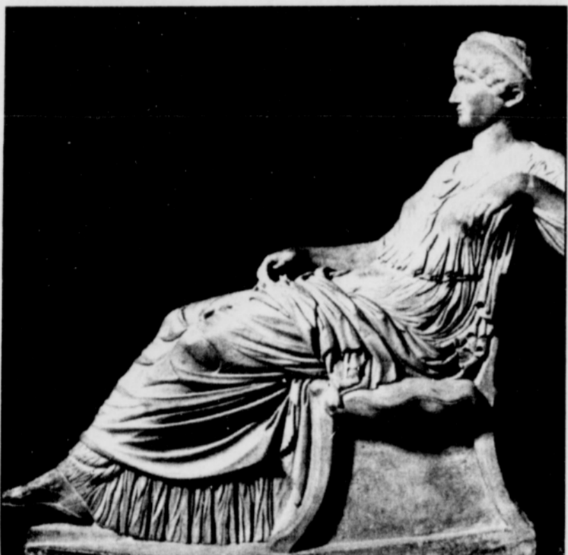
Marble copy of Greek original dating from the 4th Century B.C. Museo Capitolino, Rome.

between an unsuspecting reader's ribs - thinly disguised as a geographic misstatement.