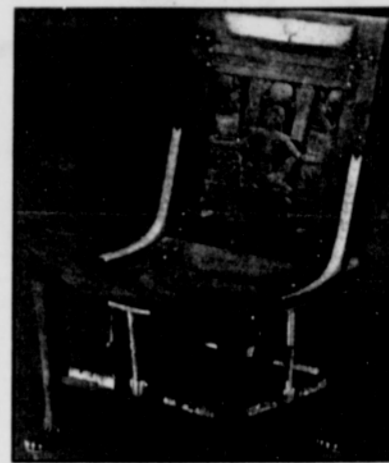
Empire style chair from King Tut's Tomb