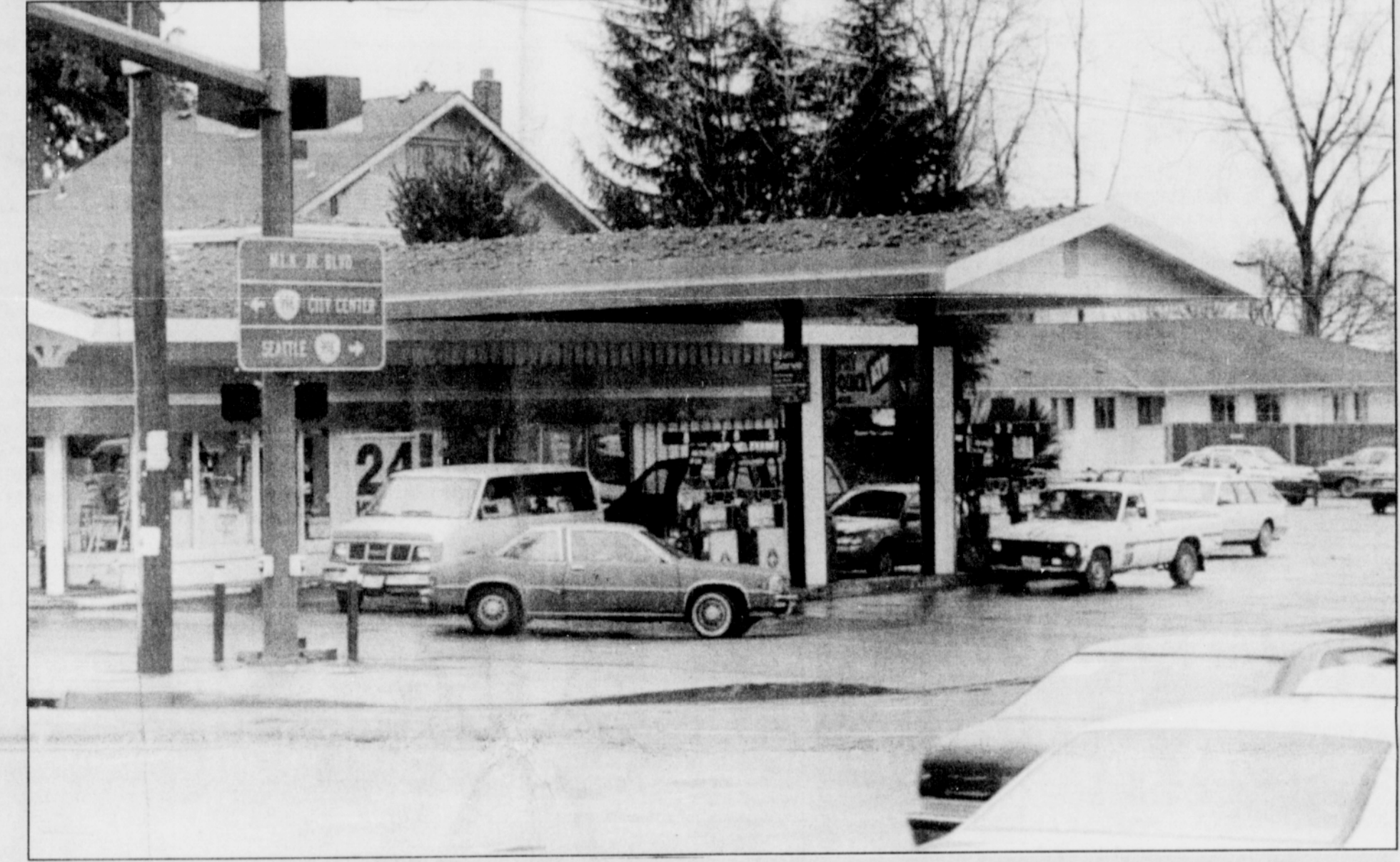
Pumps across the state are displaying the lowest price for fuel in the last decade. Enjoy it why it last's.