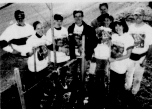
PGE helps Seed the Future at a tree planting in Portsmouth.