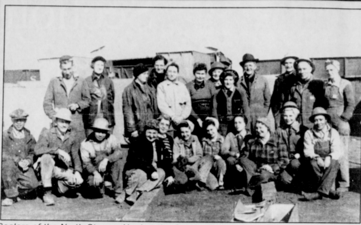
Sealers of the North Storage Yard at the Oregon Ship building Corporation. The Kaiser company in Portland recruited 25,000 Blacks to build Liberty ships during World War II. March, 1944.