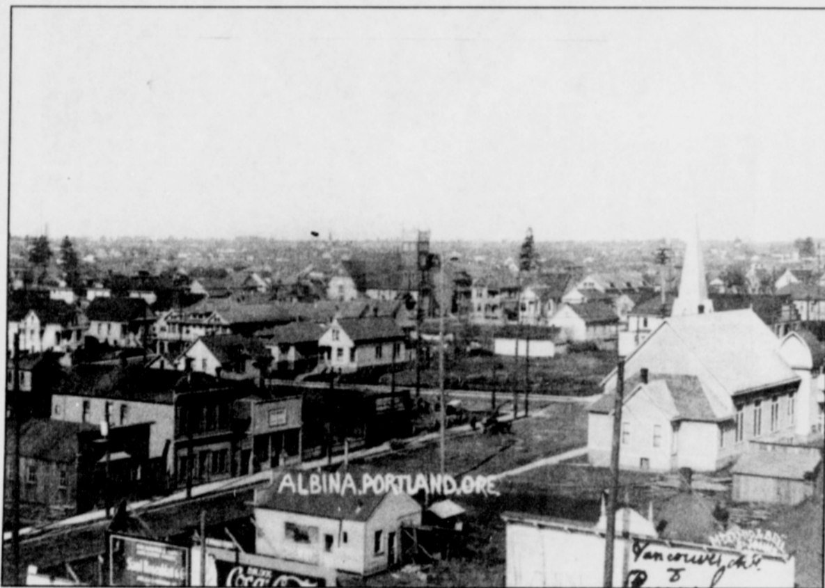
The Alбина neighborhood on Vancouver Avenue and Russell Street. Blacks were segregated to the Alбина district after the Vanport flood of 1948.