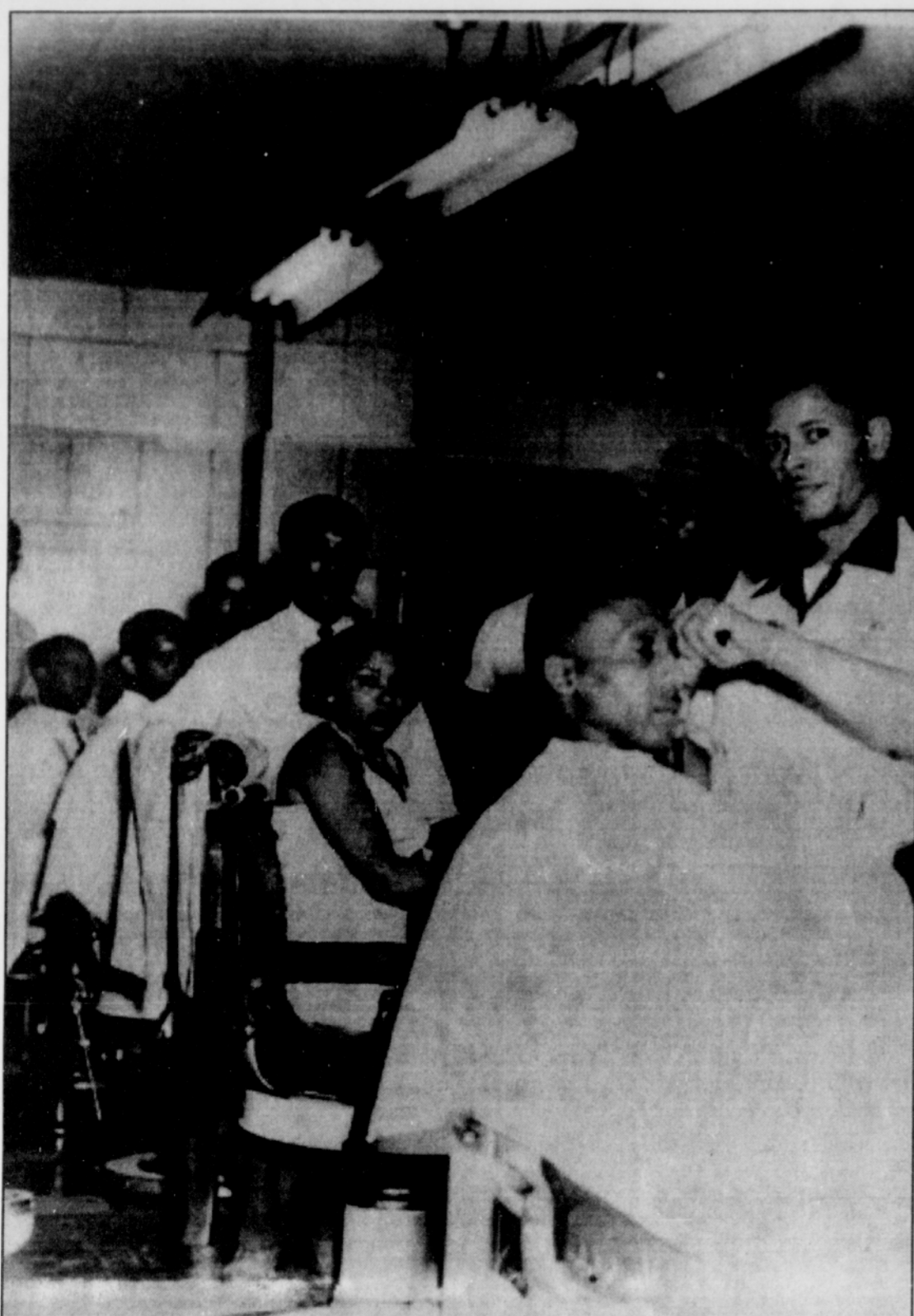
The interior of Maxey's Barbershop. There were a number of Black people operating independent shops as barbers and hairdressers in Portland. Many of the Black owned businesses ran grocery stores, tailor shops, cafes, rooming houses, furniture stands, etc.