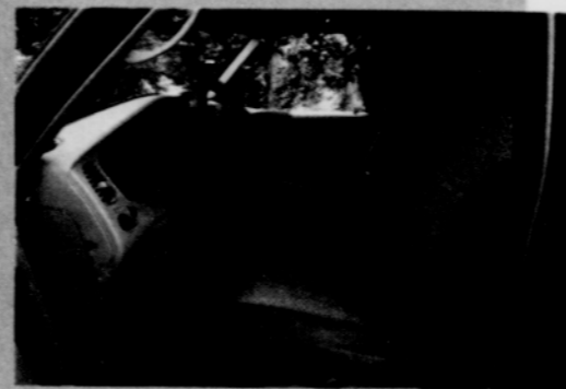
Interior Mazda B4000