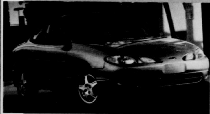
Ford Escort ZX2