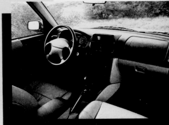
Interior of Subaru Forester