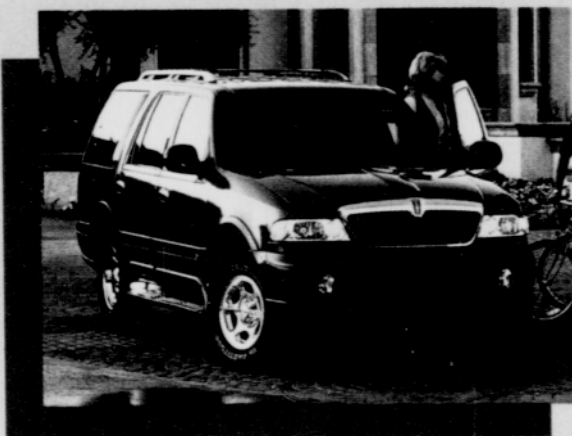
1998 Lincoln Navigator