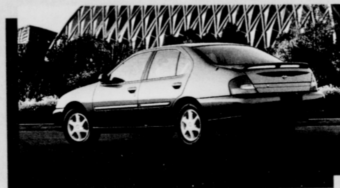
1998 Nissan Altima