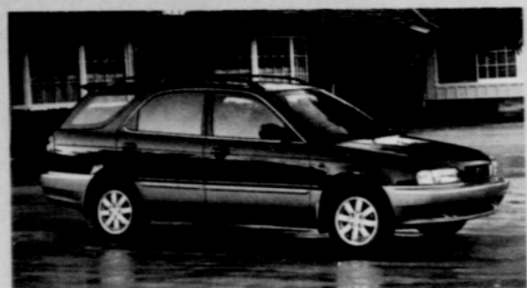
Suzuki Esteem Wagon