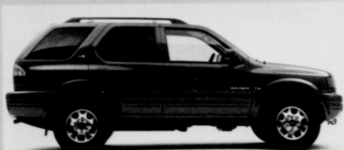
Isuzu Rodeo LS