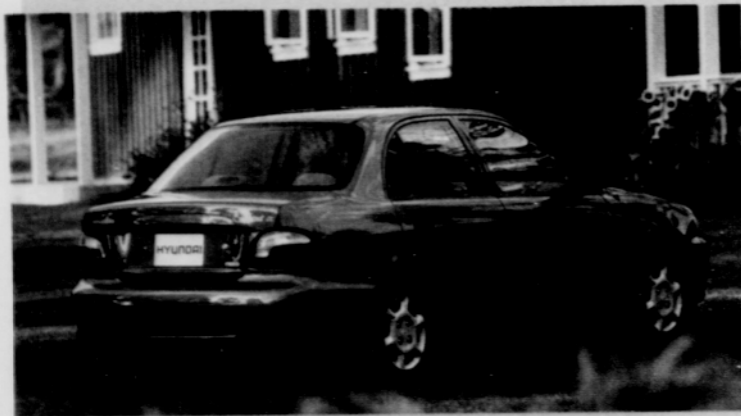
Hyundai Accent GL