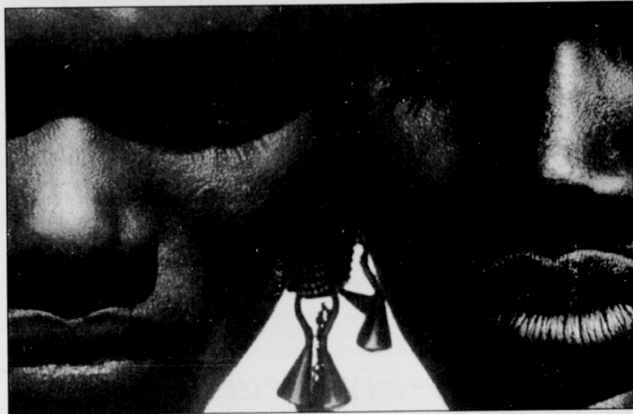
Above: Kashiro and Darati-Tight View, Africa, 1993 Herb Ritts, Courtesy Herb Ritts, Courtesy Fahey/Klein Gallery

His image of Africa capture the majesty of Africa's wildlife, the beauty of its land and the spirit of its people.