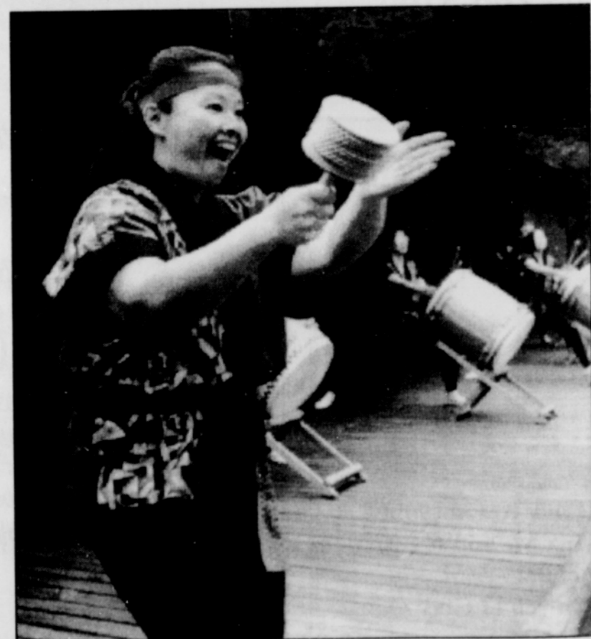
Portland Taiko 1997

Oshogatsu, or New Year's Festival, is an important celebration in both Japan and in the Japanese American community in Portland. Mochi, or rice cakes, are an integral part of the New Year's tradition, symbolizing good fortune for the year to come. Space Limited. Call 295-9709 for Tickets.