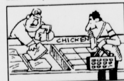
Recent studies show that fat calories in the final product are the same whether chicken skin is removed before or after cooking. That's good news because skinless chicken tends to dry out during cooking.