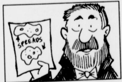
Louis Pasteur, a French scientist of the 1800s, proved that bacteria spread disease.

The department also has a special message line for Spanish speakers. The number is (503) 945-8618 and is not a toll-line.