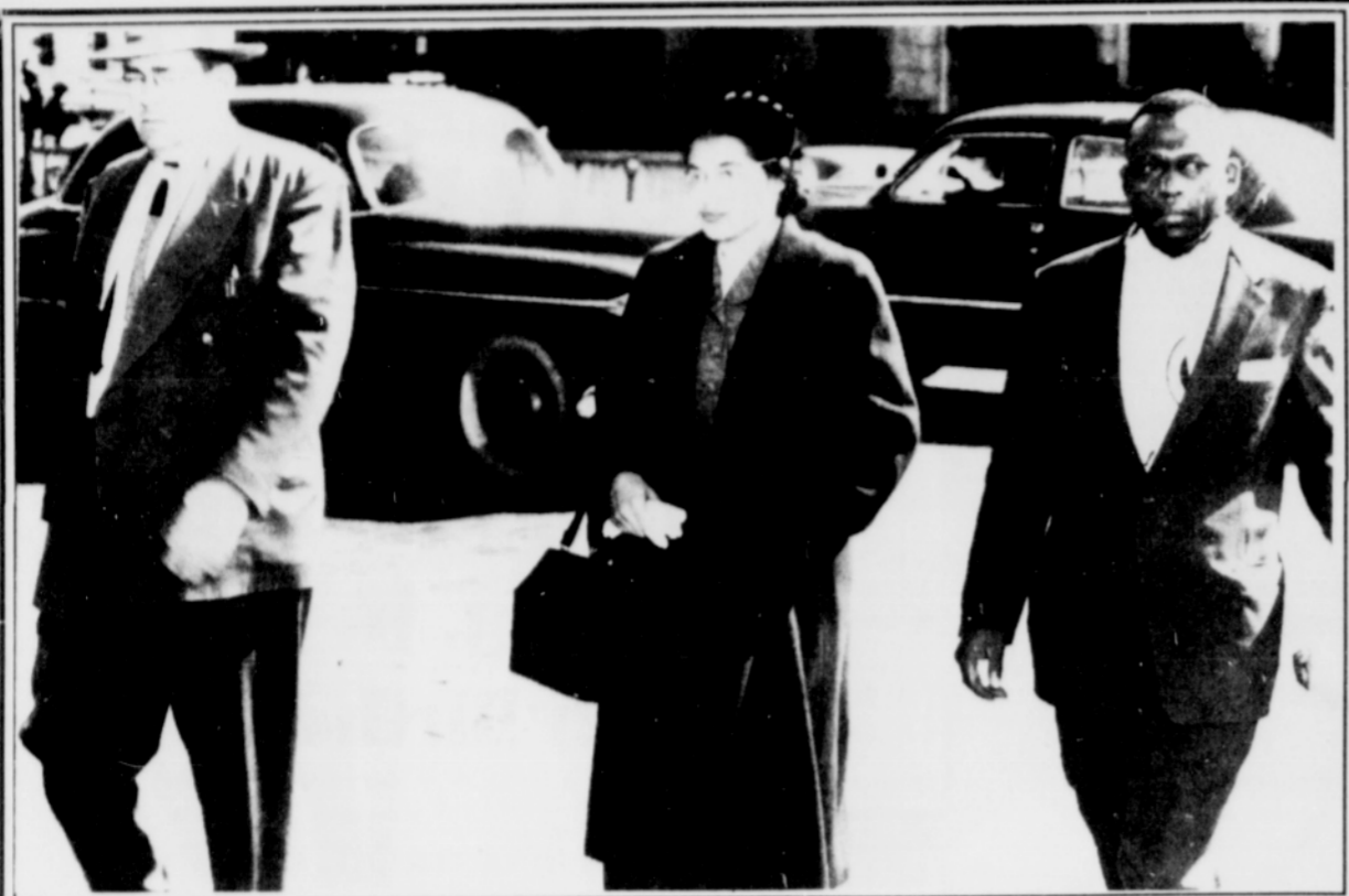
Rosa Parks, flanked by her attorney and a deputy, on her way to the jail. Parks refused to move from her up-front seat on a bus in Montgomery, Ala. in 1955.