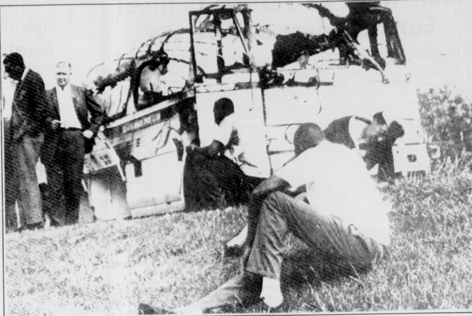
Freedom Riders Rest rest after being attacked by members of a white mob. The Riders were beaten and their bus was burned outside Anniston, Ala.