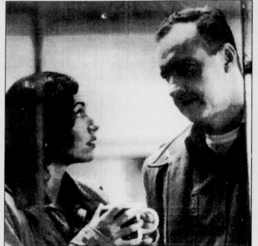
Karen (Minnie Driver, left) is questioned by the sheriff (Randy Quaid, right) in the high-action crime thriller "Hard Rain." "Hard Rain," a Paramount Pictures presentation in association with Mutual Film Company, is Directed by Mikael Salomon.