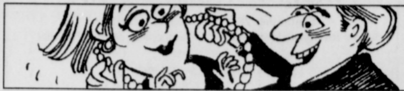
The name Margaret means "pearl."

CENTERVILLE WESTERN STORES Wrangler prorodeo CLASSIC