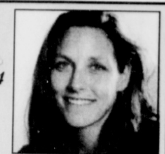
See Sports, page B3.

Portland Power lose thier 4 game winning streak to Philadelphia.