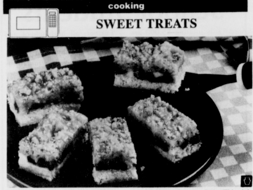
(DM)-Treat yourself to something sweet with Nutty Coconut Bars. This rich and chewy confection is made with a buttery crust, topped with layers of chocolate and white morsels, coconut, nuts and sweetened condensed milk. Using a microwave oven, a total cooking time of 10 minutes is all that is needed. Whirlpool Corporation home economists recommend overnight cooling before cutting.

* continue to use family decision making process to mediate between birth and adoptive families.