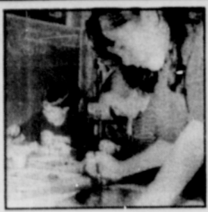
See Metro section, inside.

Project is one of several in public schools connecting students with youngsters from all walks of life.