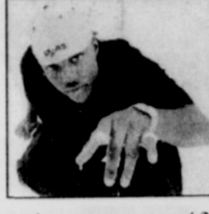
See Arts & Entertainment, page A3.

Poetic powerhouse Mase will headline with superstar Usher in Portland.