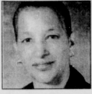
See Metro section, inside.

Area residents are dedicated to making Portland a great place.