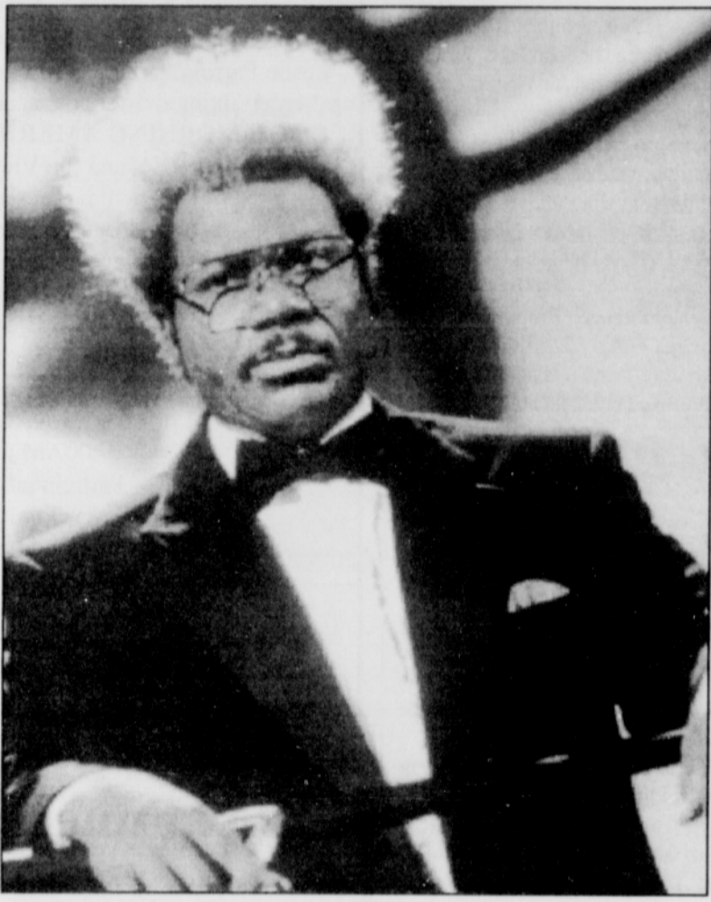
Ving Rhames playing the role as Don King

Ving Rhames ("Con Air," "Pulp Fiction") stars in the title role in the HBO Pictures presentation of a Thomas Carter Company production, Don King: Only in America , making its world premiere Saturday, Nov. 15 at 8:00 p.m. (ET)