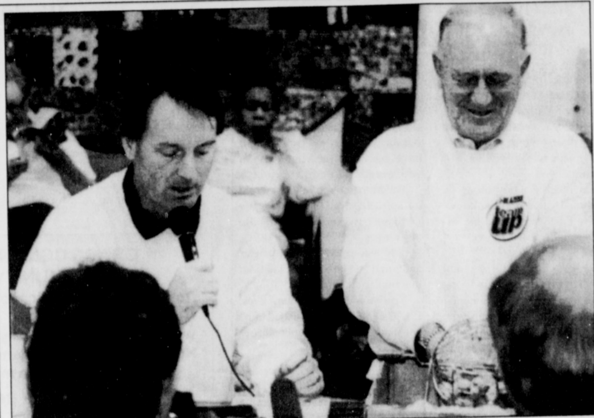
Blazer executives make right calls at bingo

Woods has already won the PGA of America's player of the year, which is based on a points system.