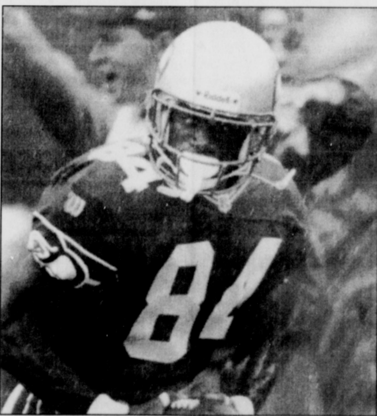
Seattle Wide Receiver Joey Galloway

Chris Warren and Steve Broussard each had touchdown runs in the second half as the