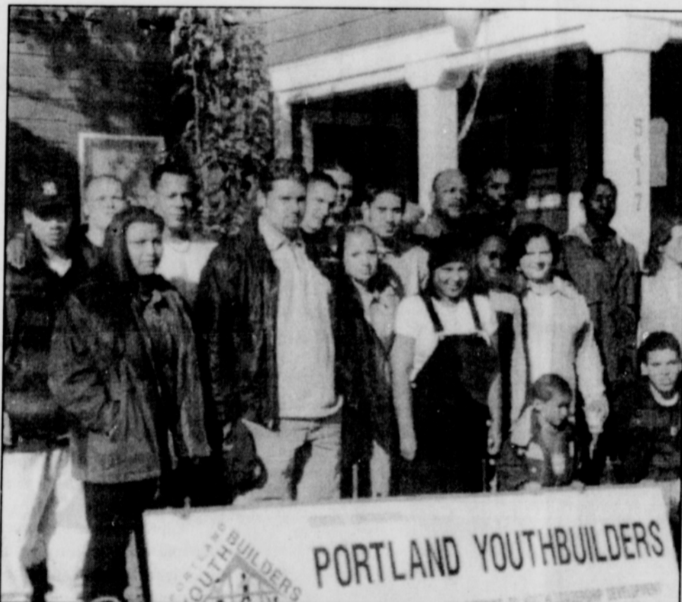
Area residents celebrate grand opening of Instar Place.