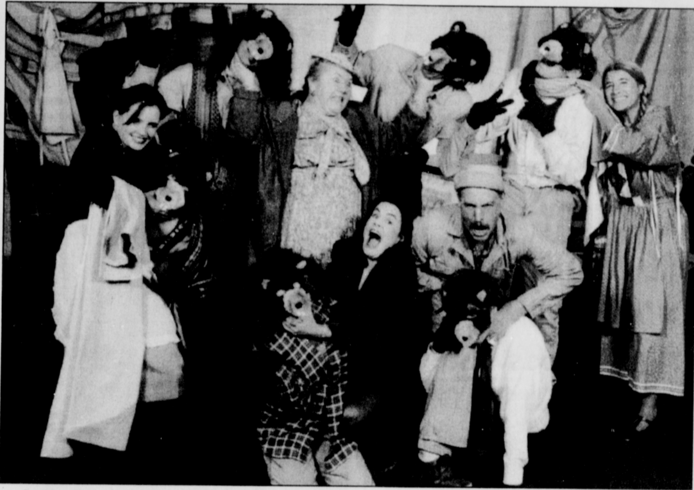
A tale of gopher feet, a trial and other miracles

SUBMISSIONS: Community Calendar information will be given priority if received two weeks before the event date.