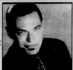
See Metro, inside.

Hot jazz musician Kurt Elling kicks off Portland fall jazz series.