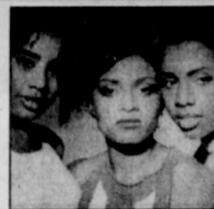
See Entertainment, page B3.

The musical landscape is a new beginning for the trio Phajja.