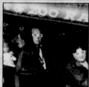
See Metro, inside

The zoo rail train turns frightening for Halloween.