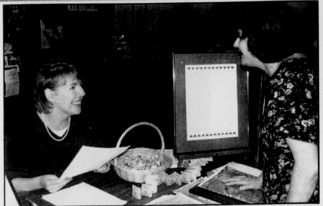
Sonitrol Security Systems explains what they value in a diversified workplace.

The State Management Association is a professional organization of state managers, executives, and agency heads. SMA's focus is excellence in public service and collaborative leadership.