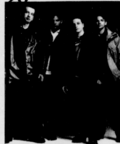
Justin Nick Drew Jeff

Hailing from Ohio, 98 is Motown's newest four-man team -- Jeff Timmons, Justin Jeffre, and brothers Nick and Drew Lachey -- 98 are sure to make the summer sizzle with the release of their self-titled debut album, "98."