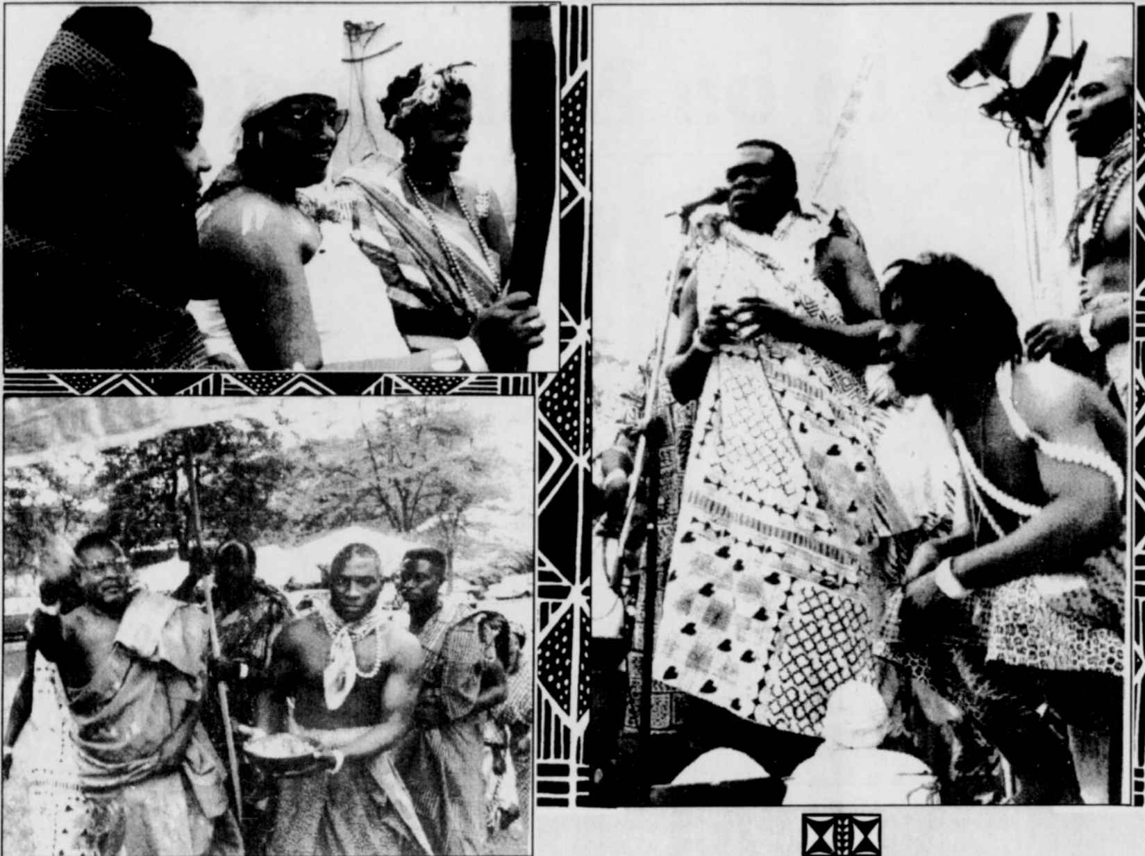
The 8th annual Homowo Festival will held August 17 at Cathedral Park under the St. Johns Bridge from 1-8 p.m. It will feature traditional music, dance, food and crafts of Africa