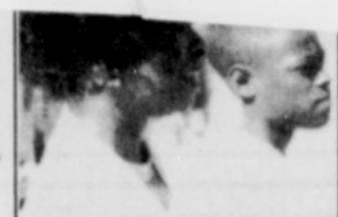
See Metro, inside.

Proud moments at the opening of Adidas in the plaza named for a longtime Portland police officer.