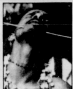
See Entertainment, page A2.

Tolerating pain as a mark of honor is explored in global proportions.