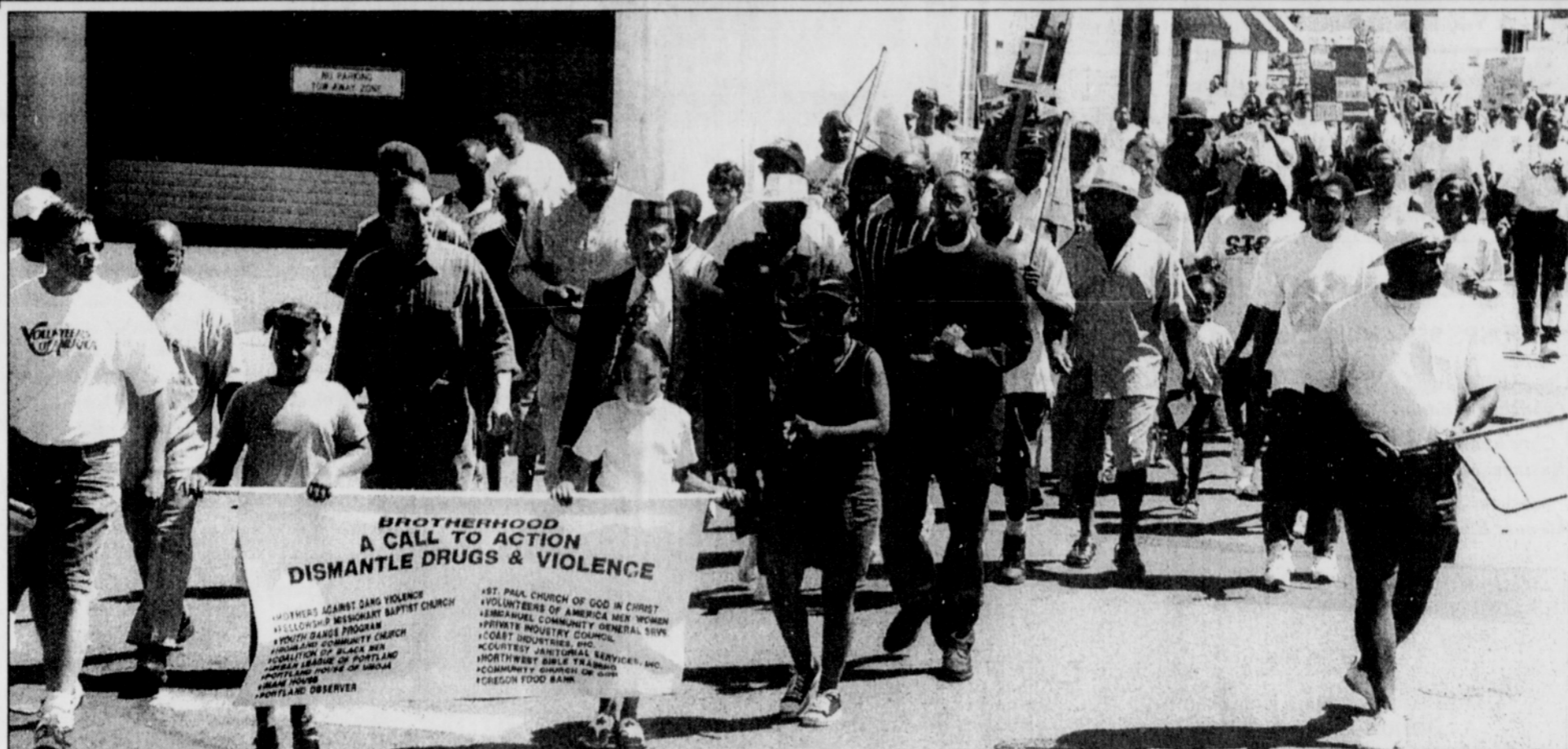
Answering the call for action People of all walks of life take to the streets Saturday, united to dismantle drugs and violence in our communities.

President Clinton reportedly plans to toughen the crackdown on smoking on federal property. The U.S. military and many federal agencies already restrict smoking in their facilities. But the Washington Post reports that Clinton plans to sign an executive order that would ban smoking in virtually every building owned or leased by the federal government.