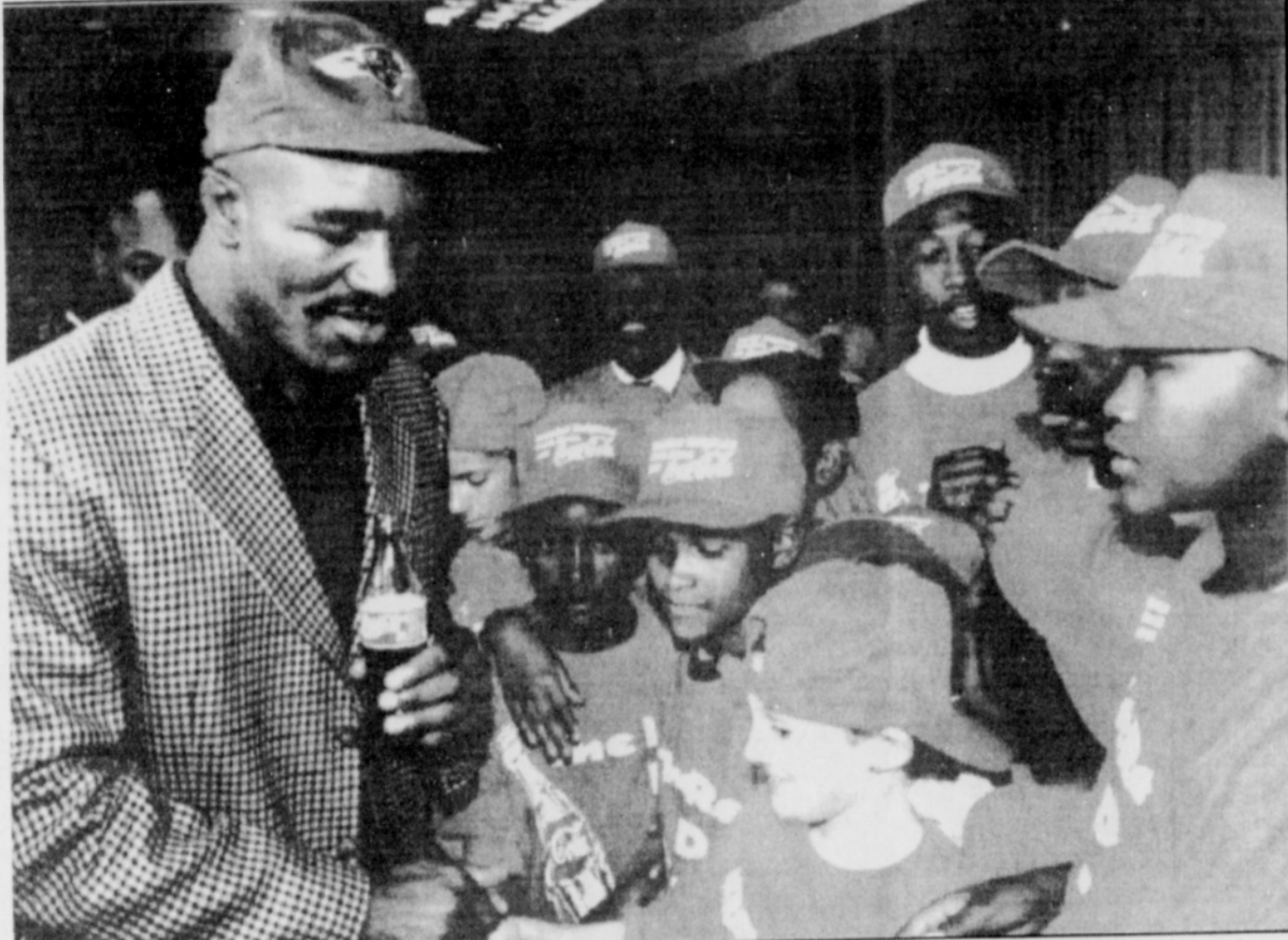
Evander Holyfield is greeted by young admirers as he arrives at Johannesburg International Airport as a goodwill ambassador for Coca-Cola and its commitment to the future of South Africa.