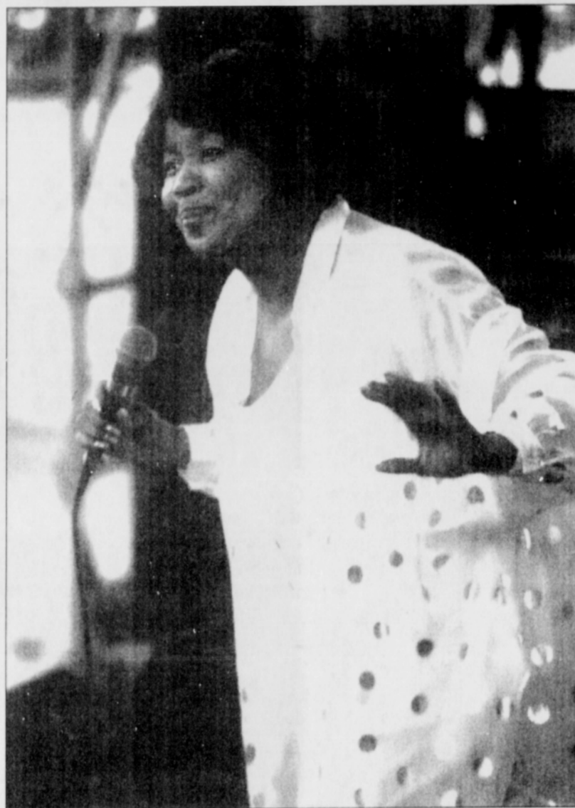
Mavis Staple presents a message of faith.

'First Family of Gospel' make return to Portland