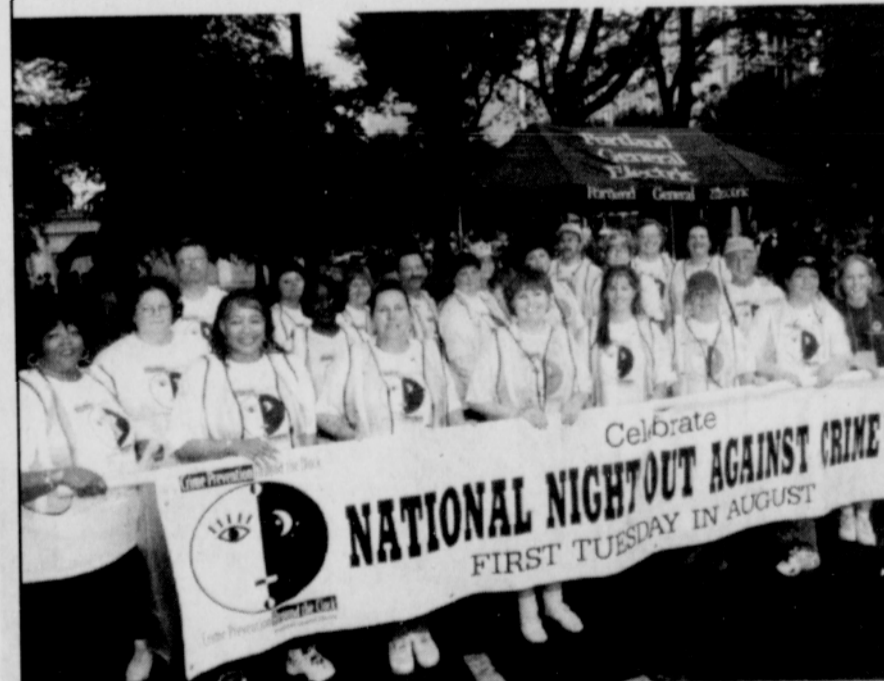
Neighborhood crime prevention volunteers promoted National Night Out in the Rose Festival PGE/SOLV Starlight Parade.

On August 5, thousands of Oregonians will hold block parties, barbecues, flashlight walks and bike registrations. It's National Night Out—America's annual night out against crime. You can get to know your neighbors, make your neighborhood safer and have fun!