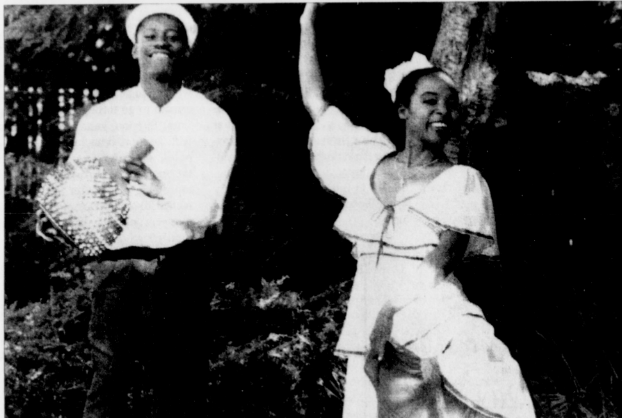
Cuban dance artists present workshop at PSU

Portland State University's World Dance Office presents a three-day Afro-Cuban dance workshop.