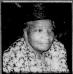
See Metro section, inside.

Awards of honor are presented to Portland area women at first annual event.