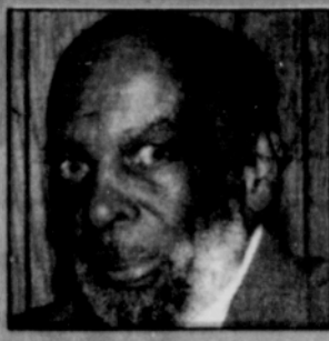
See Metro section, inside.