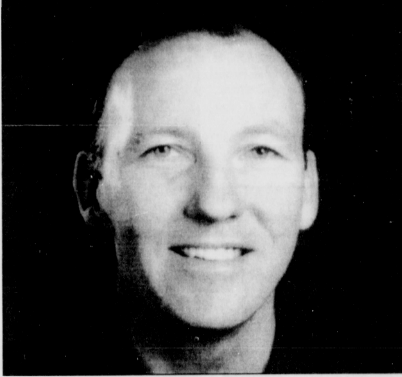
Mike Dunleavy, former Milwaukee coach was named Tuesday to coach the Blazers.

"Certainly they are one of the bigger teams in the league, and they have a terrific point guard in Kenny Anderson, who can push the ball."