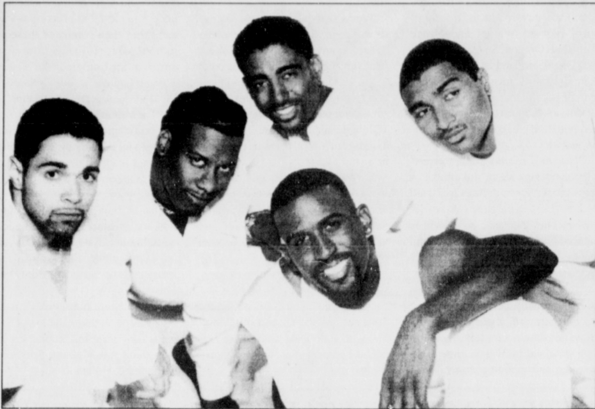
Dion, Allen, Darryl Anthony, Marc Nelson, Shawn Rivera and Kenny Terry

The members of Az Yet (Dion, Allen, Darryl Anthony, Marc Nelson, Shawn Rivera and Kenny Terry) -- the Philadelphia-born quintet responsible for the platinum-selling "Last Night," which hit number one on Billboard's R&B singles chart and was currently a top 10 "Hot 100 Single" -- learned two important lessons this past year: it pays to trust friends and sometimes you can depend on the kindness of strangers. After several years of constantly calling LaFace Records, leaving messages and trying to get the attention of the label's co-owner Babyface, the group finally reached the celebrated producer/singer/songwriter through a circuitous