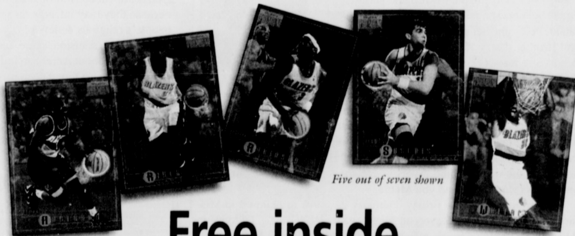
Five out of seven shown