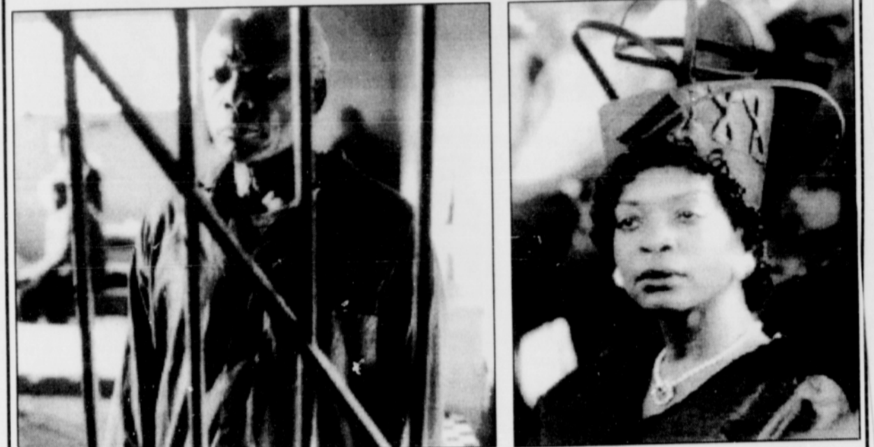
Sidney Poitier (left), Tina Lifford (right), and Michael Caine (playing de Klerk) star in Mandela and de Klerk.

Featuring month-long programming schedule to salute African-Americans including the Showtime Original Picture Mandela and de Klerk , and short films by African-American filmmakers