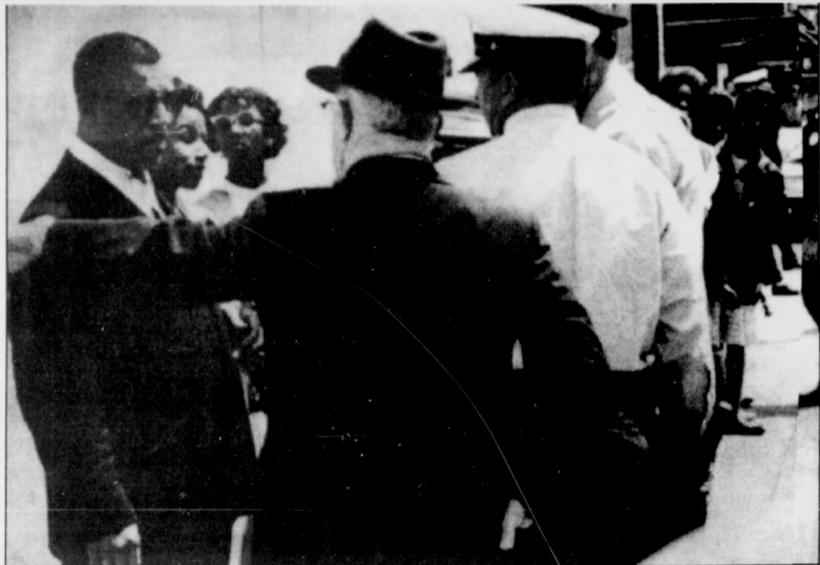
Blind singer Al Hibbler gets the word from "Bull" Connor.

February is Black History Month Call 288-0033 To Advertise