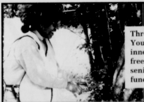
Through the League's Summer Youth Employment Program, inner-city youth are paid to do free yard work for low-income seniors. The program is entirely funded by local companies.