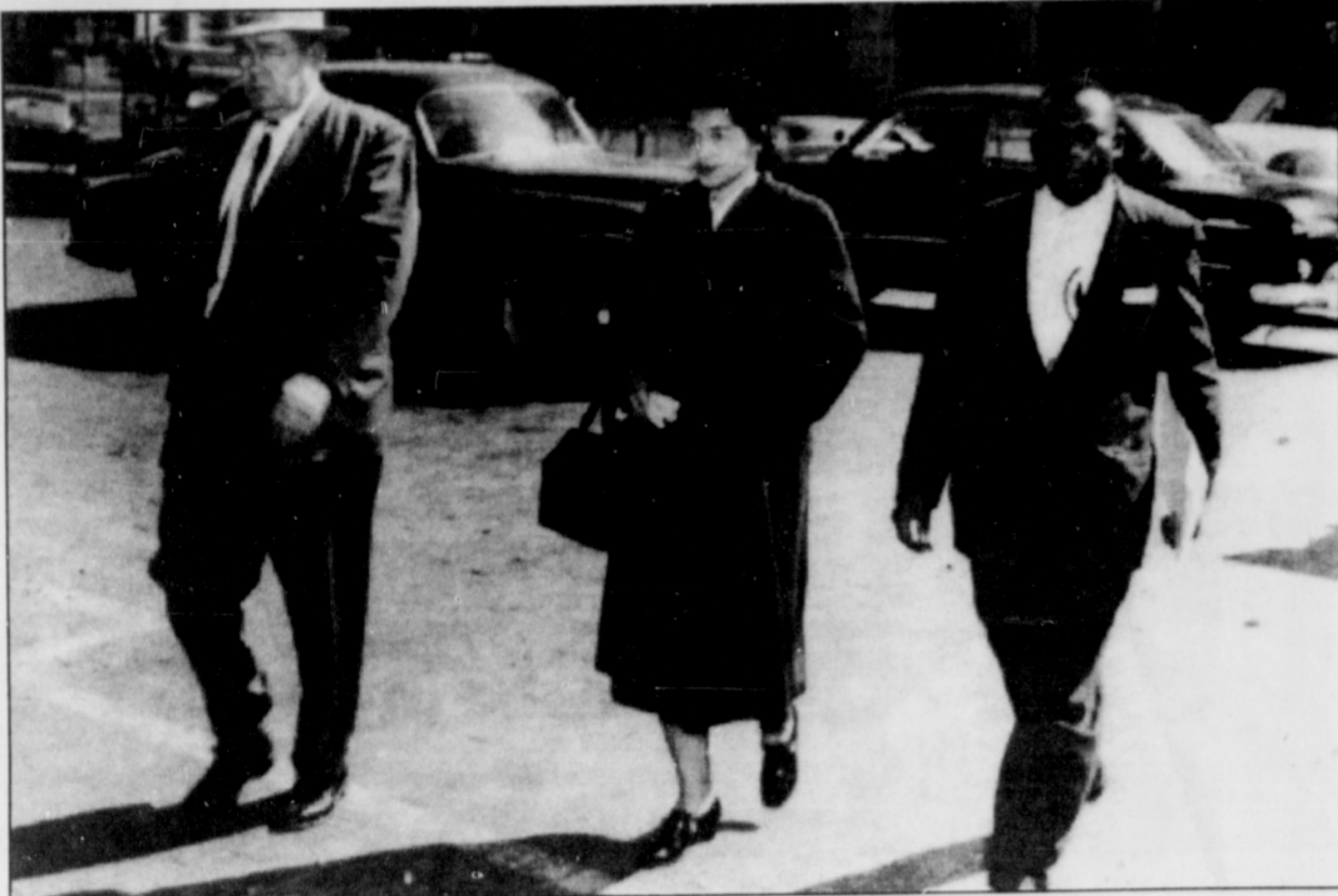
Rosa Parks, flanked by her attorney and a deputy, on her way to the jail.