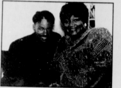
Some of the stars participating in this National College fundraising program include: Take 6 (pictured with Lou Rawls left), Tevin Campbell and Ann Nesby (above), Blackstreet (above right), and The Isley Brothers (below right).

and will deliver a funkified version of hip-hop that has put the "super-group" in a category by itself.