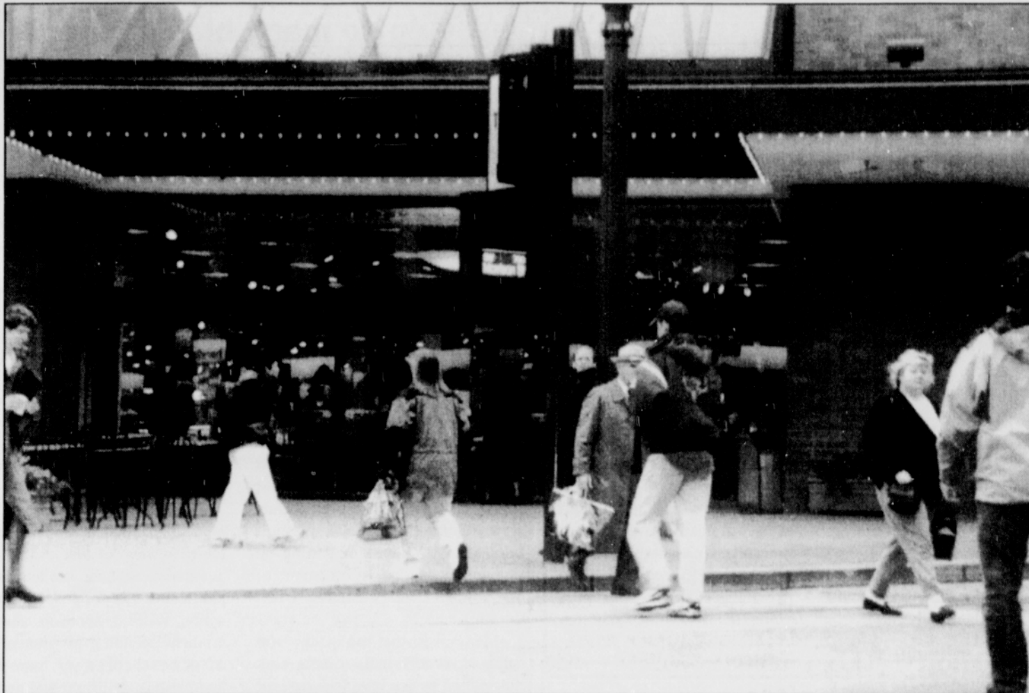
Portland shoppers become more frenzied and numerous as the Christmas holiday fast approaches.

SUBMISSIONS: Community Calendar information will be given priority if dated two weeks before the event date.