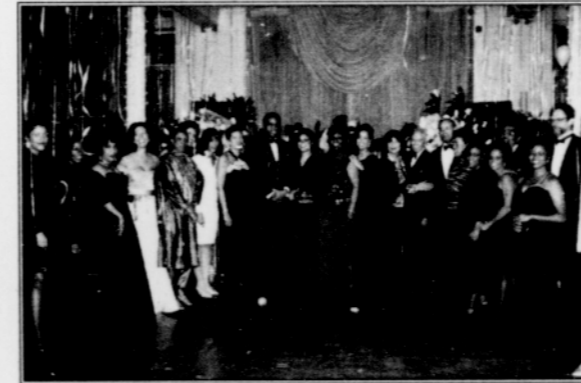
Support Network and Honorees at their '95 New Year's Eve Gala.

"We should build and take care of our communities working together to solve our problems"