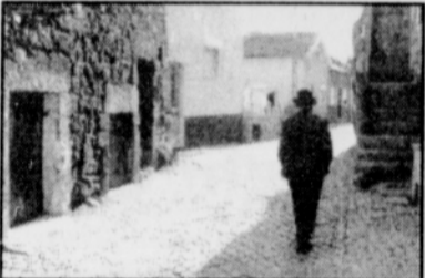
Ghetto: Belmonte, Portugal. By F. Engal. From "The Cryptojews of Portugal" photo exhibition at Cafe Sol, through December.