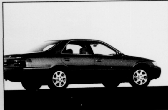
TOYOTA CAMRY XLE V-6

VW has come back strongly with a wide array of pleasing products, most notably "the PASSAT sedan and wagon." Whether ordered with the highly responsive 172hp 2.8L VR-6 or the incredibly fuel efficient (about 41mpg hwy) 1.9L turbo-diesel, this is a great package. If utility, economy and affordability are desirable traits for you, then GOLF works very well in these areas. For about $14,000, you can get a five-passenger hatchback that gets a whopping 50 mpg around town when equipped with the 90hp 2.0L turbo-diesel. Standard engine is a gas powered 115hp 2.0L four.