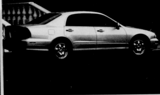
MITSUBISHI DIAMANTE LS

Power comes from a new 290hp 4.0L 32-valve V-8 -- the first production V-8 for this company -- and launches XK8 to 60 mph in under seven seconds; ably assisted by a 5-speed automatic transmission and four-wheel independent suspension.