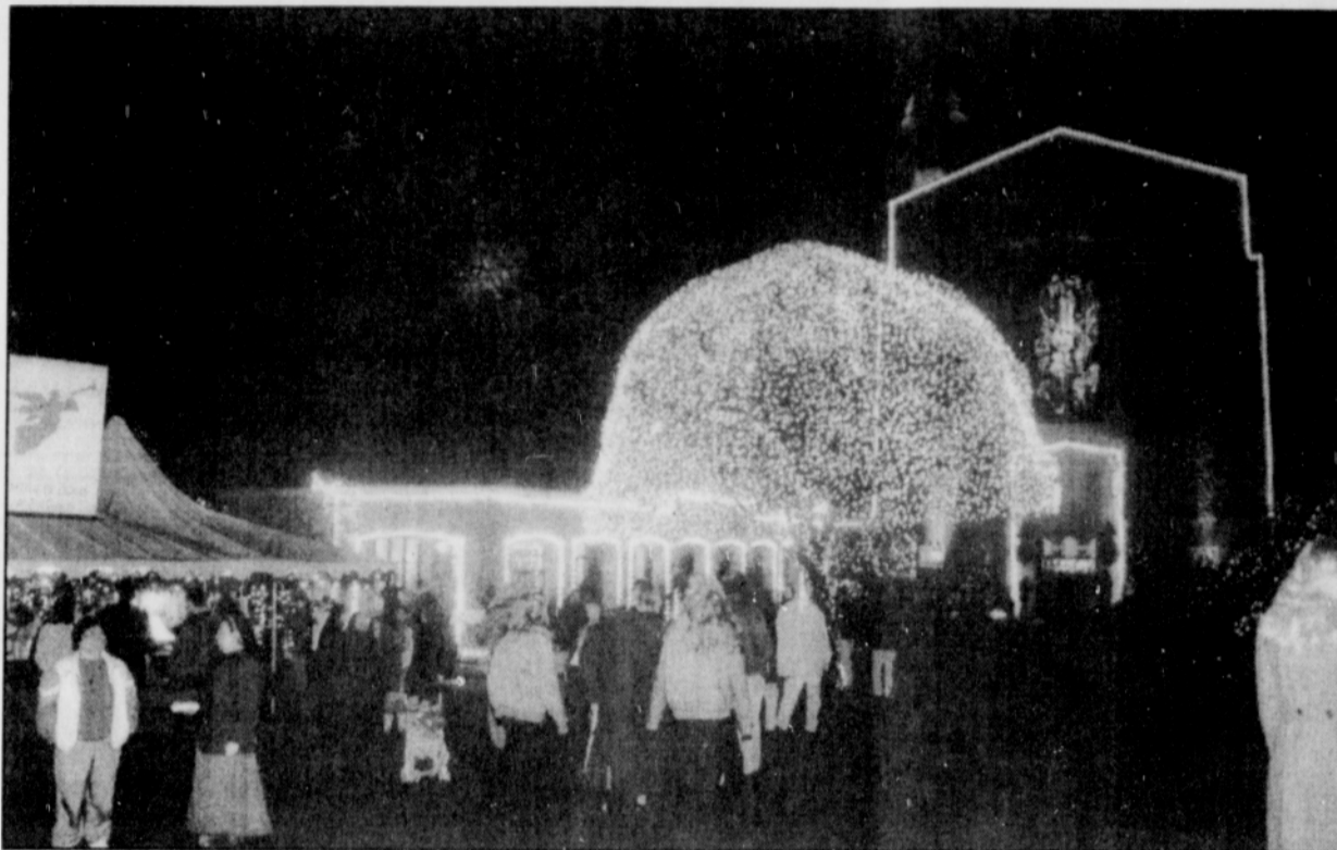
The 1996 Festival of lights at The Grotto.

Unique characteristics—Offering spectacular lighting displays, hourly holiday concerts, and heartwarming family entertainment, the Festival of Lights endeavors to surround visitors with the sights, sounds, and emotions which are so intrinsically a part of this wondrous season. The Grotto's Christmas celebration is unique from other major holiday activities in the region in at least six ways. (1) Offering 28 thematic lighting dis-