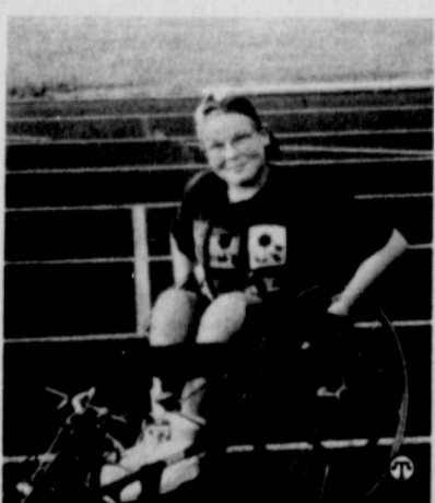
Wheelchair racing is a favorite event during the week-long camp for teens with spinal cord injuries.

our lives is just like that: periods of planning and preparation punctuated by short bursts when we have one chance to be a champion, one chance to own the greatness that hangs in the balance. Life isn't a marathon; it's goal-setting followed by long stretches of uncelebrated work, capped off by a handful of shining moments.