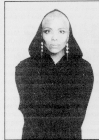
Dee Dee Bridgewater

Dee Dee Bridgewater is among the greatest jazz singers currently gracing the planet. Together with dynamic young pianist Terrason, she presents a tribute to the First Lady of Song, Ella Fitzgerald. One of the jazz events of the year, a must for true jazz fans!