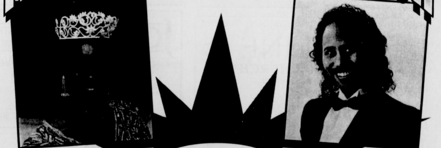
DONNA KNIGHT MISS BLACK OREGON USA 1995