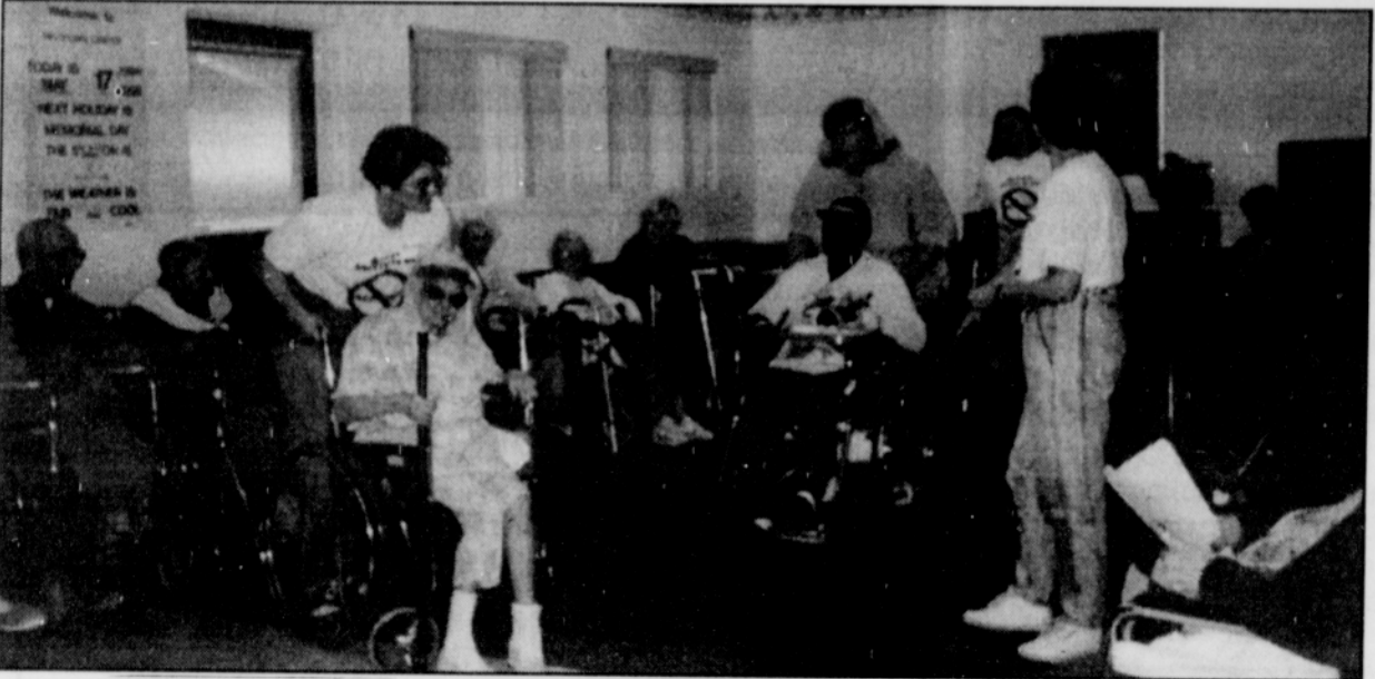
Staff and residents celebrated National Nursing Home Week May 12-18 with many activities. The "Crowning" glory was our Del's Biggest Ever Banana Split, where staff and residents built a 3 foot banana split with all the toppings - and then enjoyed eating it.