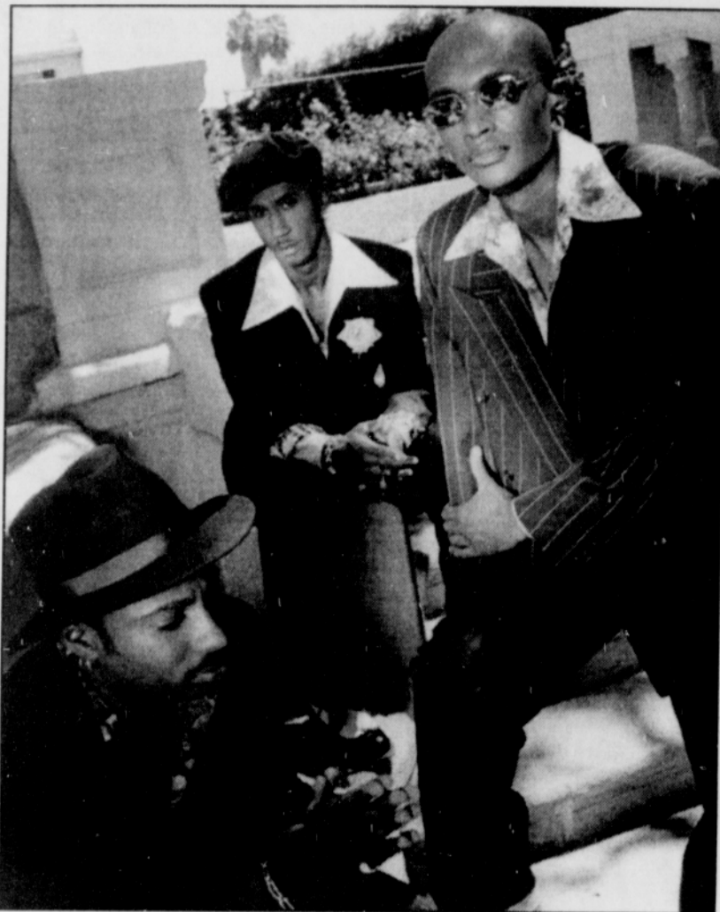
Art n' Soul

3620 N. Williams (next door to House of Sound Records), record label representatives to producers will be on the panel, 10:00 am- 4:00 pm.