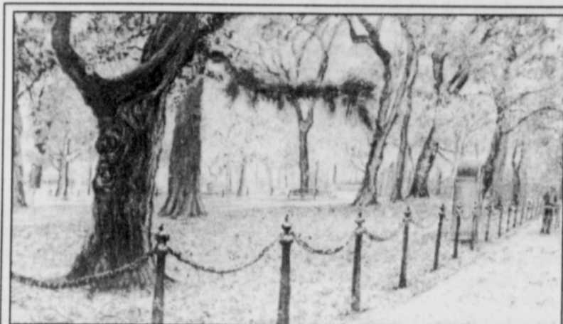
The Interstate Firehouse Cultural Center presents "Women and Spirituality," a group show of works in various media by members of Oregon Womens Caucus for Art. The show runs June 6 - 28. The center is at 5340 N. Interstate Ave. and is open Monday-Friday from Noon to 5:30. The First Thursday reception featuring a lecture on "Networking with Women Artists in America," will be June 6 from 6 to 8 p.m.

No cameras, recording devices, dogs, or re-entry. Sand chairs only. No outside food or beverages will be allowed on site.