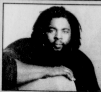
See Entertainment, page B3.