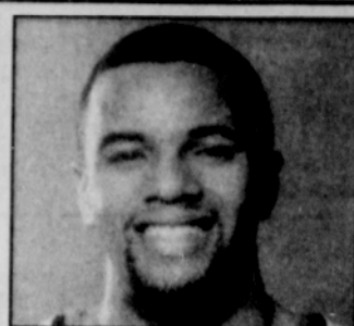
See Sports, page B5.

Portland native Damon Staudamire of the Toronto Raptors was named rookie of the year.