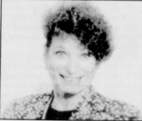
Mayor Vera Katz

The Portland Multnomah Progress Board, co-chaired by Portland Mayor Vera Katz and Bev Stein, Multnomah County Chairwoman, unveiled a report that shows things are looking up for the Portland Area. More people have confidence in local government, the economy continues to enjoy dynamic growth, and the crime rate remains fairly steady.