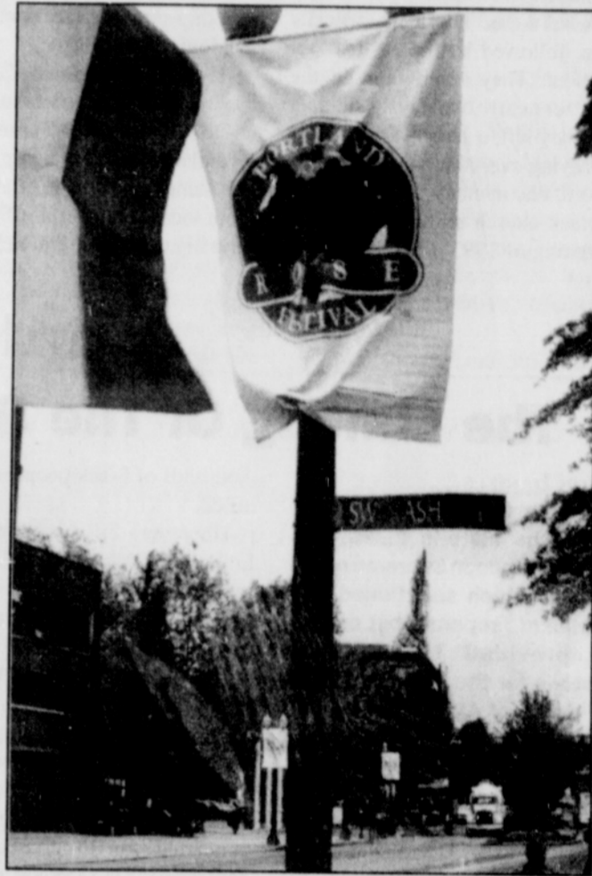
The 88th Rose Festival gets underway in earnest Thursday with the coronation of this year's Rose Queen. With the theme, The Winning Spirit, the event boasts over 70 sanctioned events. The annual festival attracts more than 2 million people to the Portland area.